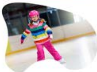
Figure Skating Programs